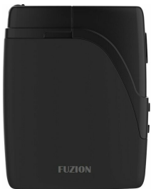
1 * FUZION Device

The Fuzion kit comes with the following: