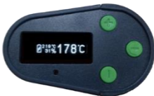
Charging in power-on state