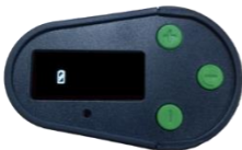
Charging in power-off state

USB port function: The USB port can be used for charging and updating firmware. During charging, the battery icon is blinking. When the device is charged in power-on state, the screen turns blank after 30 seconds and displays charging icon; when charged in power-off state, the charging icon is displayed in the center of the screen.